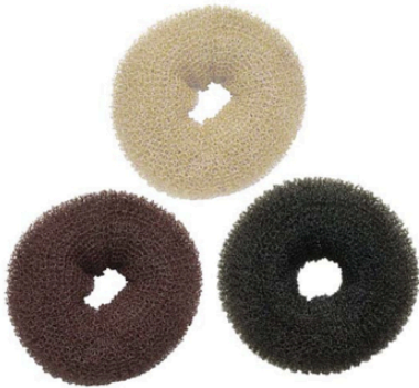
*Required* Hair donut: choose size and color based on hair length/thickness. Can be bought at Claires, Target, Amazon, etc.