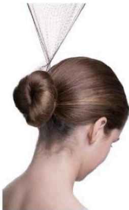
*Required* Bun hair net: Can be bought at Target, Amazon, CVS, etc.