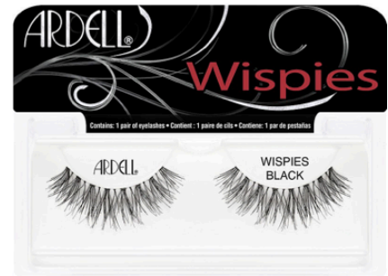
*Suggested* Eyelashes: Ardell Wispies Ages 5+ please wear mascara if you choose not to wear lashes. All teens need lashes. Can be purchased at Target, CVS, Amazon, etc.