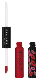
*Required* Rimmel Provocolips Color: Play with Fire Can be purchased at Target, Amazon, etc.