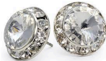
*Required: Level III* Earrings: the largest in this style. Comes in post & clip on. Can be bought at Labrie Dance.